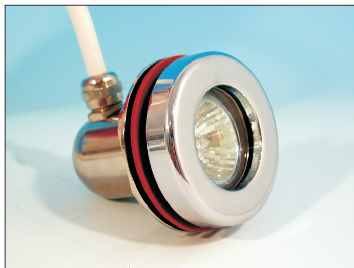
Light complete with escutcheon in chrome

With silikon-cable for high temperature, length 2,0 m